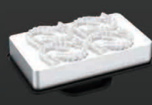
Indirect Bonding Trays